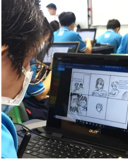
Working on a comic strip to summarise learning