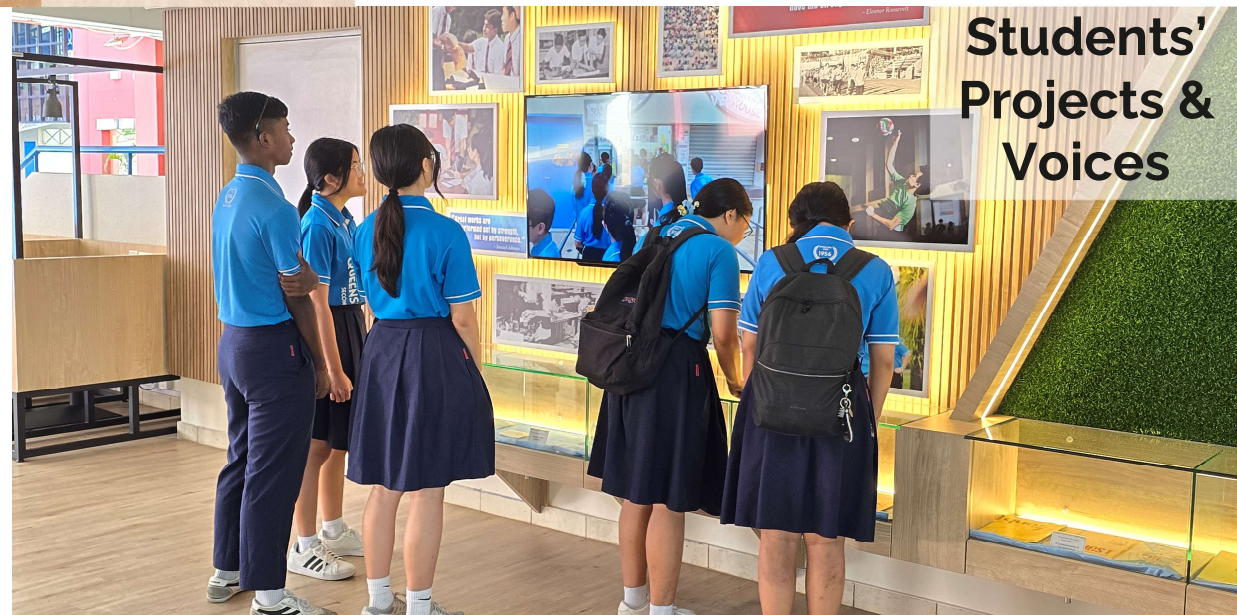
Students' Projects & Voices